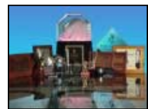
Customer Service Award.