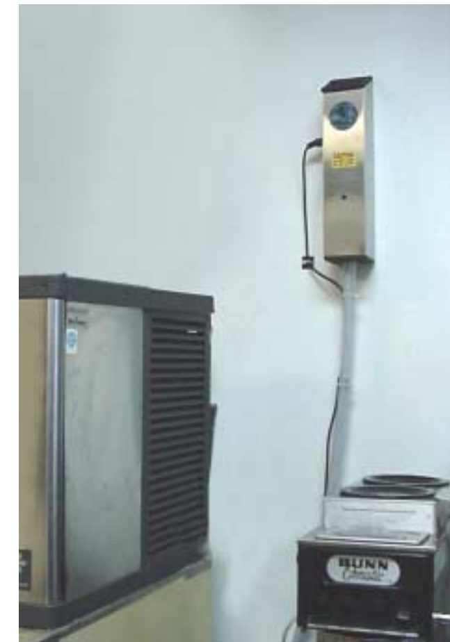
Ice machine odor and bacteria control